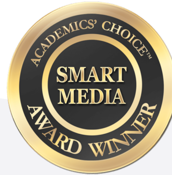
2020 Academics' Choice Award Winner Secrets of the Heart TV